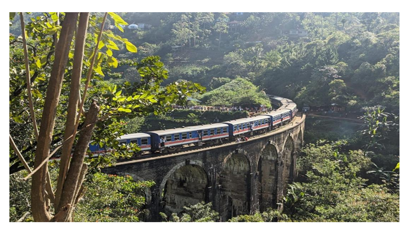
Train rides to mountains and Tea Estates,